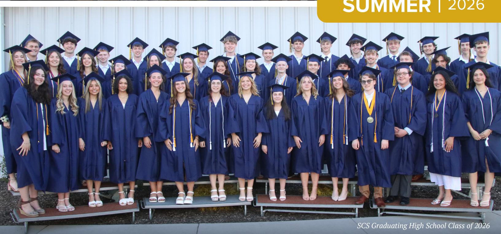
SCS Graduating High School Class of 2026

Rejoice Always. Pray Continually. Give Thanks in All Circumstances.