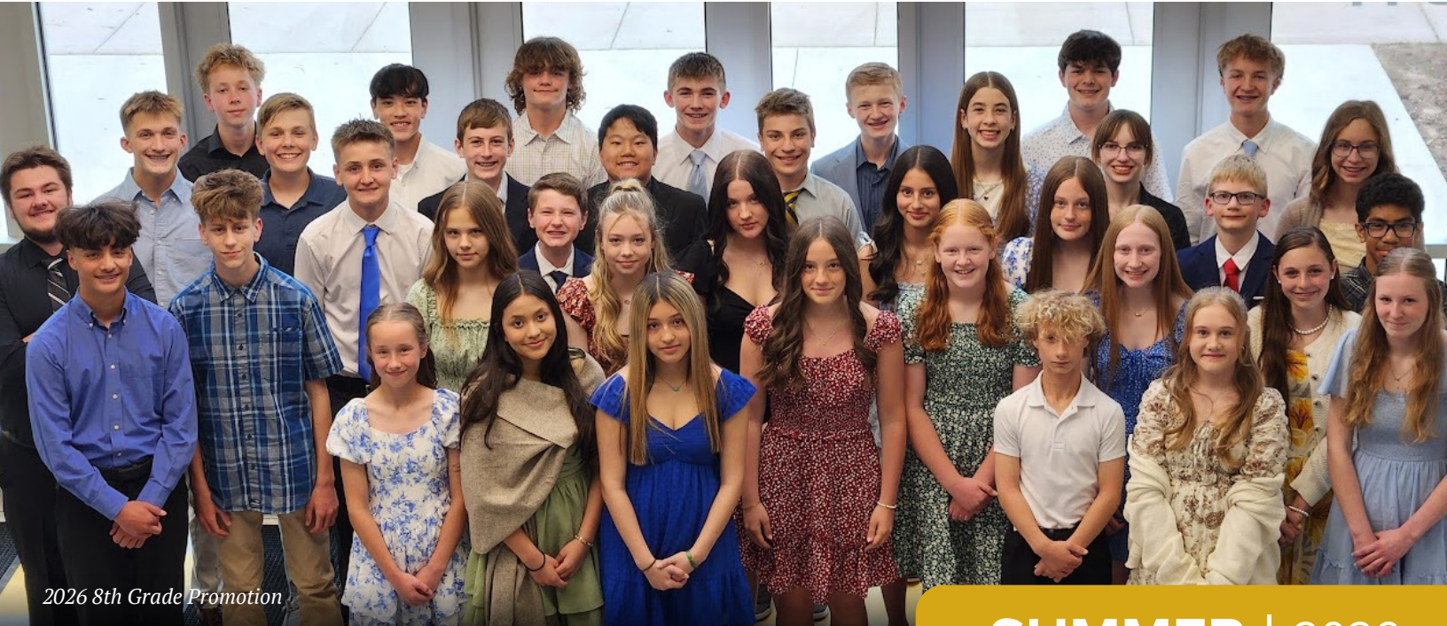
2026 8th Grade Promotion

Scholarship | Discipleship | Citizenship