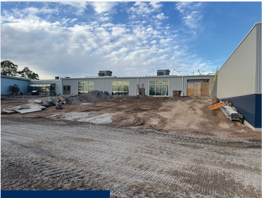
Rear view cafeteria