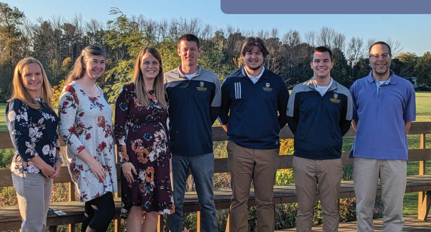
Not featured: Jackie Molter (maternity leave)