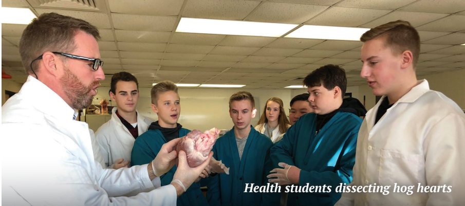
Health students dissecting hog hearts