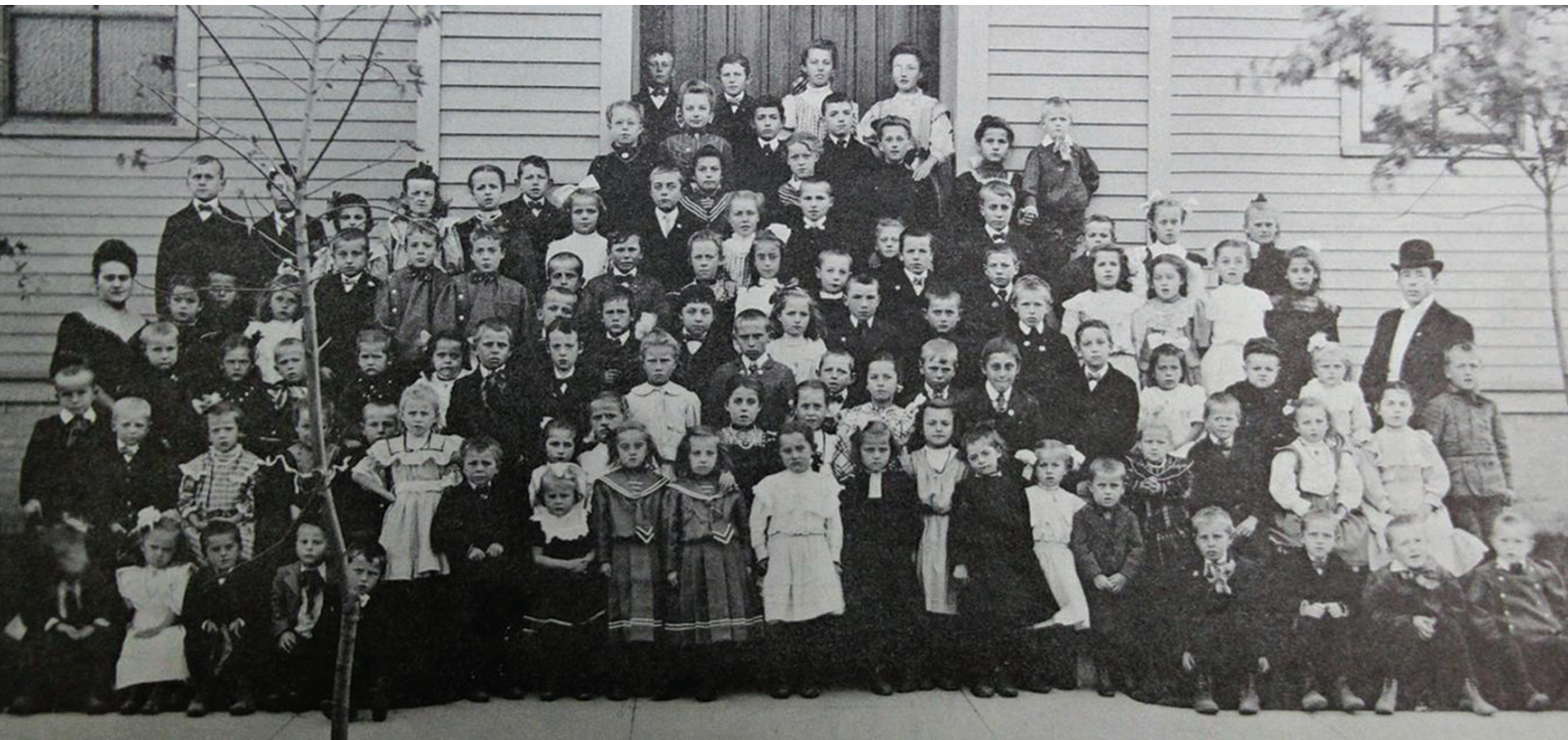
Historical photo of SCS