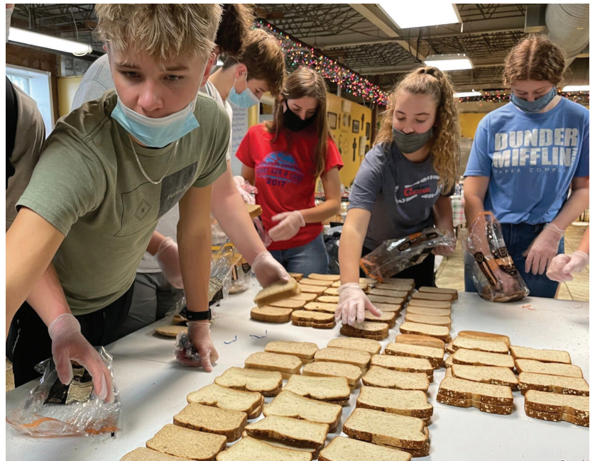
Students in Atlanta

Students were able to choose from 25 different offerings not typically covered in the high school curriculum. The course offerings this year included: Mission Trip to Atlanta, How To Get Hired, Programming Simple Video Games, STEM in the Real World, Sign Language and Deaf Culture, Musical Composition, Biblical Foundations of Worship and Prayer, Faith and Fitness, and more.