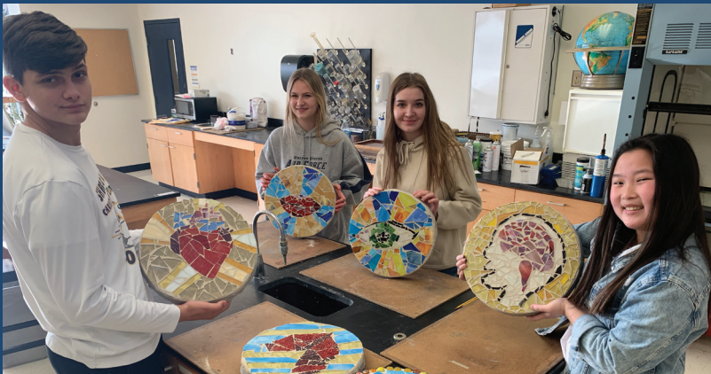
Students exploring mosaics in Discovery Term